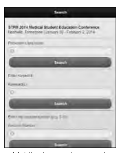
Mobile site session search