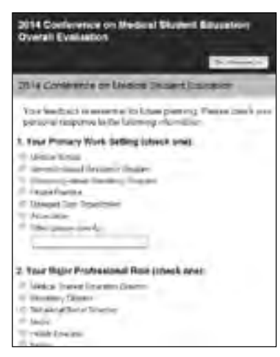
Mobile site evaluation