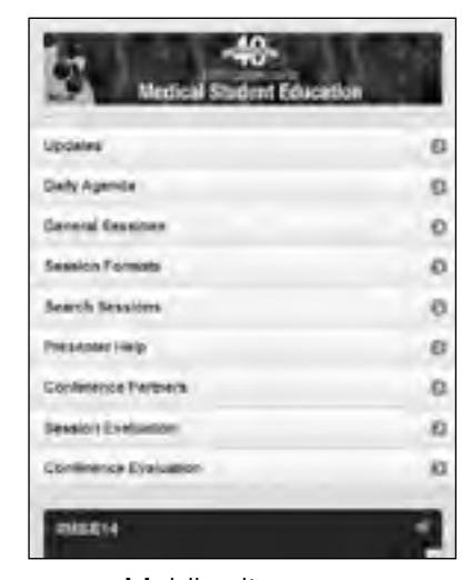
Mobile site menu

Free wireless access in the session rooms. Select the oprylandconvention wireless network, then: Username: medicine Password: stfm1967