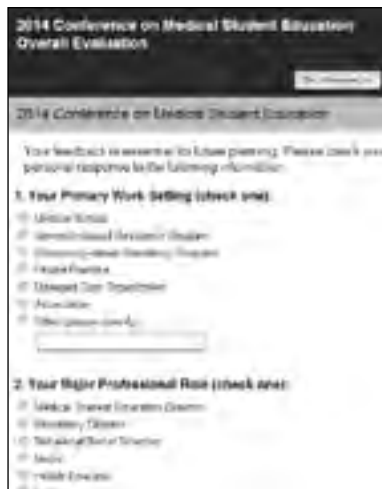
Mobile site evaluation