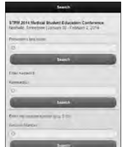
Mobile site session search