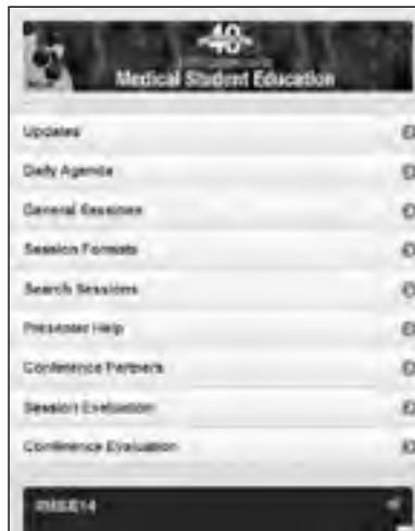
Mobile site menu

Free wireless access in the session rooms. Select the oprylandconvention wireless network, then: Username: medicine Password: stfm1967